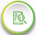
VAT & Tax