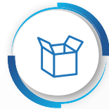
Item & Product

OneBook inventory management is the process of efficiently overseeing the constant flow of units getting in and out of an inventory and controls the costs associated with the inventory by managing product wise GST/VAT, price settings, stock management and many more.