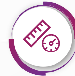
Unit of Measurement