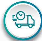
Delivery & Due Date